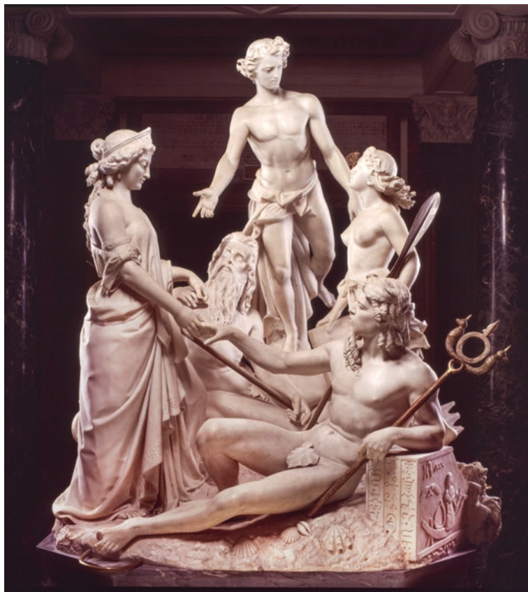
Il taglio dell'istmo di Suez (The cutting of the isthmus of Suez)

Allegorical marble group by Pietro Magni (1863), depicting Europe uniting the Mediterranean and the Red Sea, while the geniuses of Commerce and Shipping behind them give their blessing