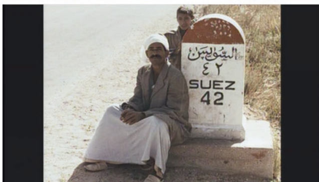
Frames from the documentary film Il Canale by Bernardo Bertolucci (1966, commissioned by ENI, Ente nazionale idrocarburi).