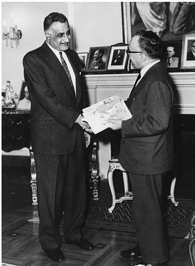
Cairo, 1968. Gamal Abdel Nasser and Giorgio La Pira