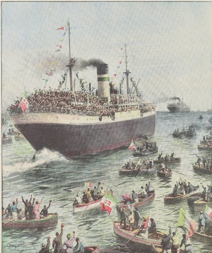
Le entusiastiche dimostrazioni degli Italiani residenti in Egitto al passaggio nel canale di Suez delle navi che trasportano le nostre truppe nell'Africa Orientale.