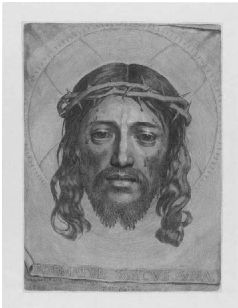
Figure 1.1 Claude Mellan, Face of Christ on St. Veronica's Cloth (Holy Face) , 1649. Engraving, 46 × 34.8 cm. Rijksmuseum, Amsterdam, RP-P-OB-69.798.

de Marolles, friend of Mellan and avid collector of the artist's works. In his Memoirs , de Marolles gives the following explication: