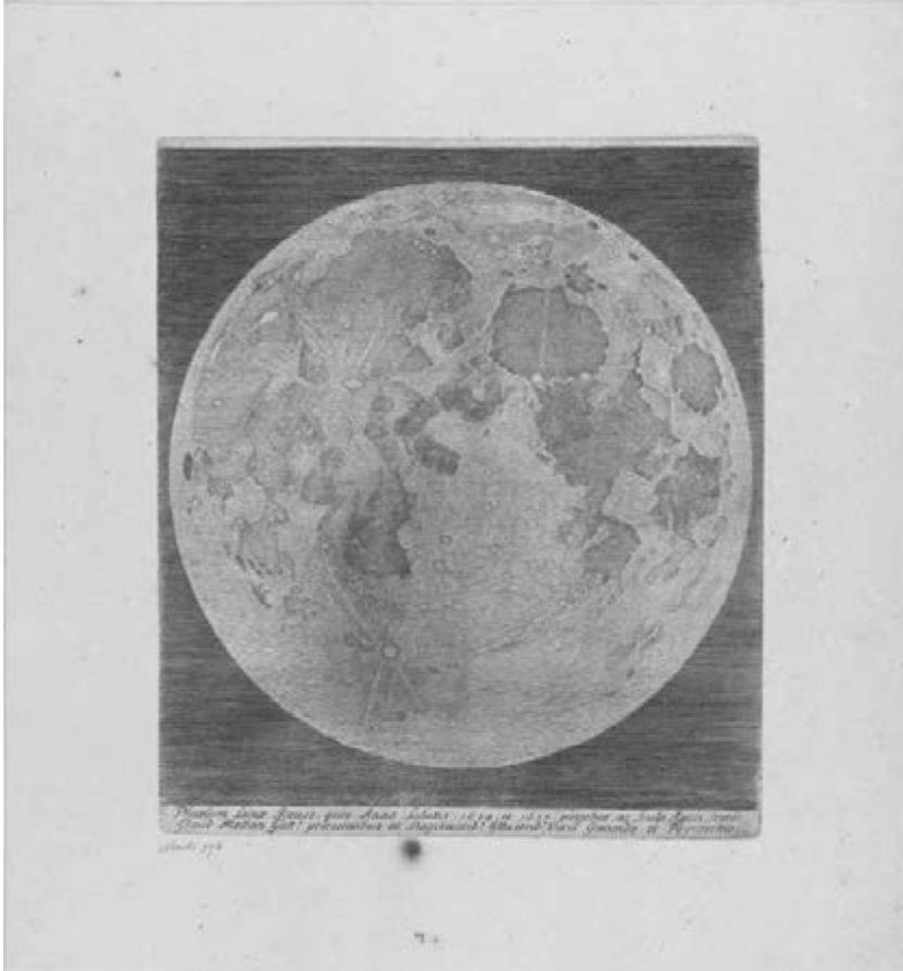
Figure 1.2 Claude Mellan, Full Moon , from Three Representations of the Moon , 1635. Engraving, 24.8 × 21.7 cm. Rijksmuseum, Amsterdam, RP-P-OB-71.150.

This might be construed as an implicit challenge to François de Sales' topos of the facile printer of images, because, in this case, the engraved matrix after nature exceeded the printer's abilities.